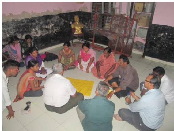
Disaster Risk Identification & Vulnerability Assessment with the community at Mahatma Gandhi Vasti

The primary research has been completed in Mahatma Gandhi Vasti. Expert inputs are roped in for development of Hazard mapping/ potential disaster risk profile at community (slum) level. Community lane mapping and infrastructure mapping has been conducted with the help of women, children and men from the slum. A preliminary sample survey is also conducted to develop the community profile and to understand their awareness vis-à-vis disasters and its risk reduction. This has fed into development of disaster risk profile/ hazard profile and community's vulnerability to potential disasters. The primary research is in progress for Janata Vasahat slum and will be completed by July end.