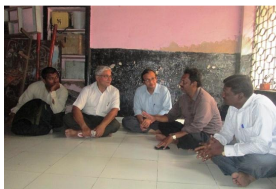
Interactions with the community at Gandhi Vasti Slum

Initial meetings were held with the community representatives at both project locations-Mahatma Gandhi Vasti and the Janata Vasahat slum on Parvati Hill for rapport and confidence building with the community to establish a long term association with them throughout the project period and beyond. The project team introduced the project and proposed interventions to the community representatives.