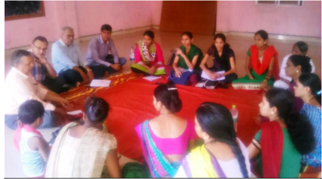
Interactions with the community at Janata Vasahat Slum

Consultation workshops are conducted at both the slums – Mahatma Gandhi Vasti and the Janata Vasahat Slum on Parvati Hill to gain insight into the existing situation in slums, history of disasters occurred within the community and to identify potential hazards and risks associated with natural and/ or manmade disasters. An initial listing has been done by the community. To enable active participation of the community in the process their views are solicited to initiate work on field. Women played a key role in the process.